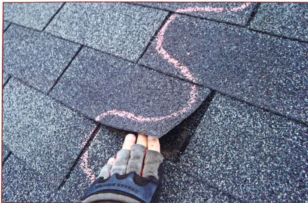
Figure 6 – Unbonded raked pattern of shingle overlaps.

Further, ASTM D6381, Standard Test Method for Measurement of Asphalt Shingle Mechanical Uplift Resistance (which is referenced in ASTM D7158), states “many factors influence the sealing characteristics of shingles in the field; for example, roof slope, and interference by misplaced fasteners.” It is not the objective of the ASTM test methods to address these issues. Therefore, in rating shingles, new, unweathered products are tested with much care being taken in the installation and the preparation of each specimen. To assume that all installed shingles will meet the uplift loads determined using the ASTM test methods is unrealistic.