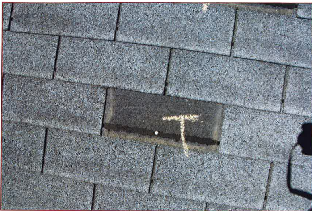
Figure 3 - Torn shingle tab.

This progression will tend to flip and crease or tear the shingle. The wind forces cause the shingle to flutter and bend such that further creases may develop ( Figure 2 ). Eventually, if the wind force is strong enough, the tabs or shingle sections break off and are carried downwind ( Figure 3 ). This is particularly the case in areas of the roof that are exposed to higher wind forces (e.g., eaves, hips, ridges, etc.). Failure typically occurs at the top of the exposed section, just below the butt end of the overlying shingle.