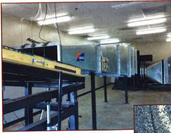
Figure 4 – Haag wind simulator.

be greater/less. In such cases, it is clear that wind would not come from all directions with just enough force to compromise the adhesion on the sides of the shingle overlaps.