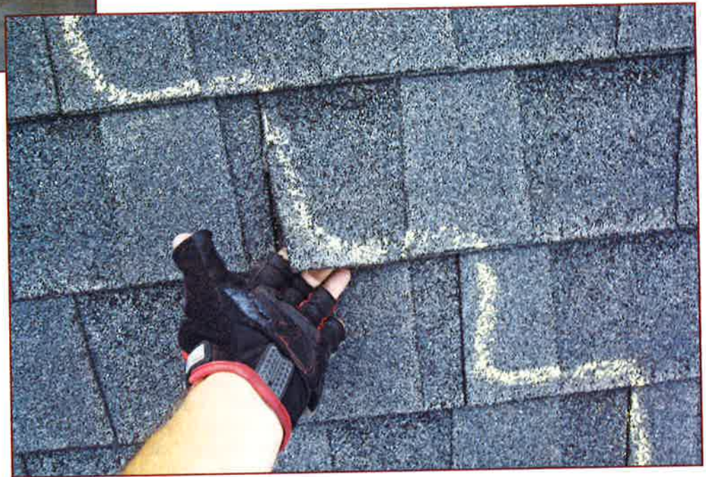
Figure 5 – Unbonded diagonal pattern of shingle overlaps.

We also note that while ASTM International and the International Code